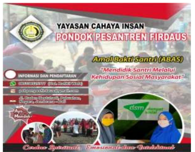
Figure 2: Amal Bakti Santri (ABAS) programme

Ponpes Firdaus Jembrana Bali shows its commitment to building good relations with non-Muslim communities through joint social activities, one of which is the Amal Bakti Santri (ABAS) Programme for 9th and 12th-grade students. This annual program involves students in social service activities, such as cleaning the surrounding environment and providing social assistance to people in need. Through ABAS, the pesantren provide a space for Santri to interact and cooperate directly with the community, creating mutual respect and strengthening relationships. This program helps reduce cultural tensions, overcome prejudice, and build trust, resulting in harmonious and mutually supportive relationships.