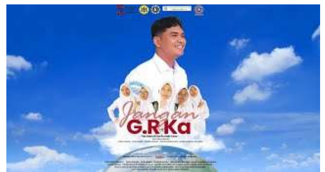
Figure 4. 2nd Place Winner of Climate Change Documentary Film

Pesantren Firdaus Jembrana participated in a documentary film competition aimed at high school/vocational/secondary school students throughout Bali held by Religion for Peace (RfP) Indonesia for Responding to the increasingly alarming rate of climate change. The competition was also organized with the support of the Asian Conference of Religions and Peace (ACRP), Udayana University's Faculty of Tourism, Gita Santih Nusantara (GSN), and Gedong Gandhi Ashram (GGA). Here is an image of the climate change documentary film produced by Firdaus High School in 2023 which won second place in the competition. The link can be clicked on the following link: <u>https://youtu.be/UI9IO_QzqaE</u>.