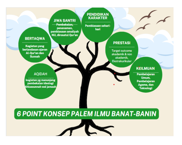
Figure 2. Six points of the palm of knowledge concept

The paradigm of science integration from the perspective of 'palm Ilmu Banat-Banin' is a series of curricula that combines all the values that have been applied and general science and religion. Six concept points can be concluded from 'palm Ilmu Banat-Banin,' which are then applied with an activity program based on the value of the concept of each science palm as follows: